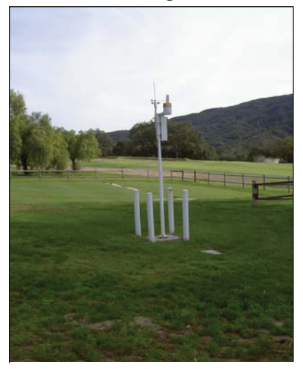
Soule Park ET Station

Visitors to the site can find real time weather information to include Evapotranspiration (ET) data for the Ojai Valley. ET data can be used to modify landscape irrigation more efficiently. The Ojai ET station at Soule Park, where the information is generated, is shown in the photo on the right.