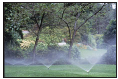
Lawns use lots of water during the long days of summers.

It is time to reset your irrigation timer to start watering fewer days and times. As daylight periods become shorter, reduce the amount of water you apply to your plants and lawns, even if the fall temperatures remain warm.