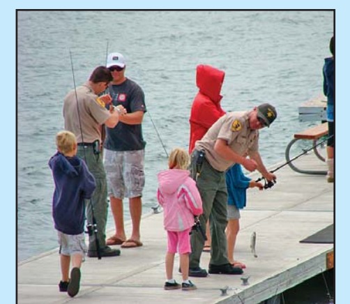
Lake Casitas Recreation Area Free Kids Fishing Day is Saturday, March 24, 2012.

Youths under the age of 16 can enjoy some fishing for free and they don't need a license. Anglers ages 16 and 17 are welcome, but they must possess a valid fishing license required by the Department of Fish and Game.