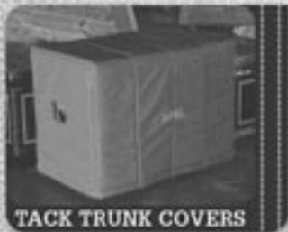
TACK TRUNK COVERS